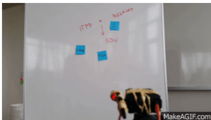
The prototype in action. Unfortunately the red laser dot on the right is quite hard to see.